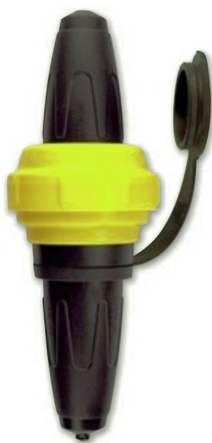
Plugs and connectors