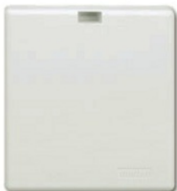
Cooker and appliance connection box