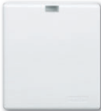
Cooker and appliance connection boxes