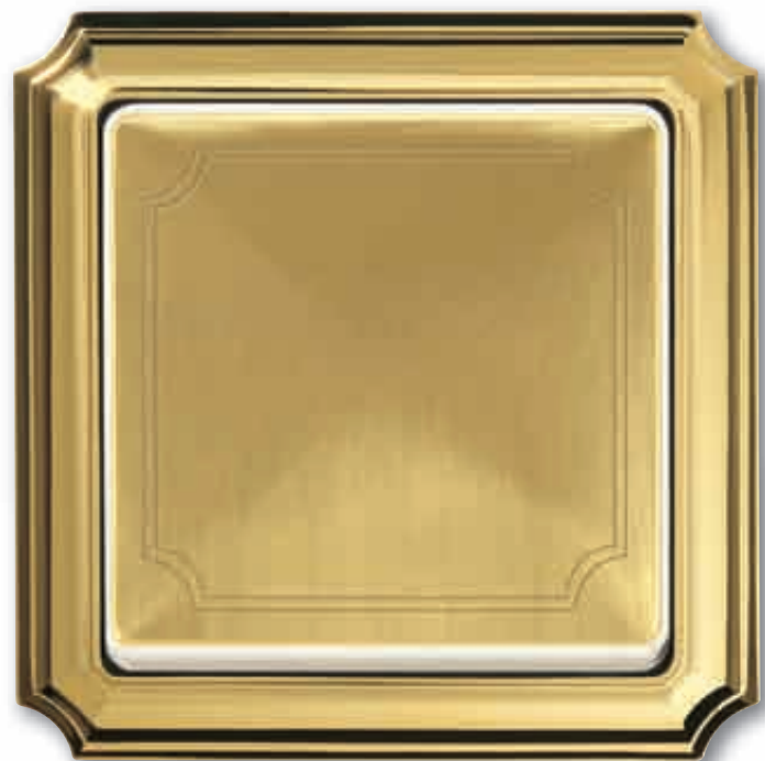
ANTI-K, actual size