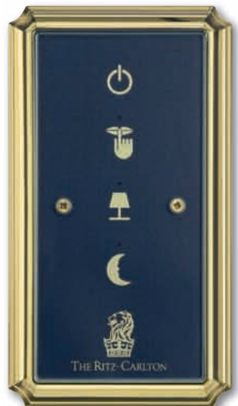
Ritz-Carlton glass push-button