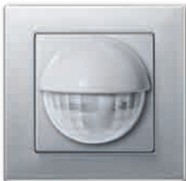
Indoor movement detector