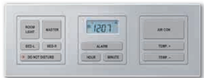
Bed Side Panel, type B, aluminium, M-PLAN design

On top of all these convenient features, the Bed Side Panel also helps you keep costs down, thanks to occupancy detection and efficient energy management. Experience the Merten Bed Side Panel and all it has to offer on the Internet as well: www.bedsidepanel.com