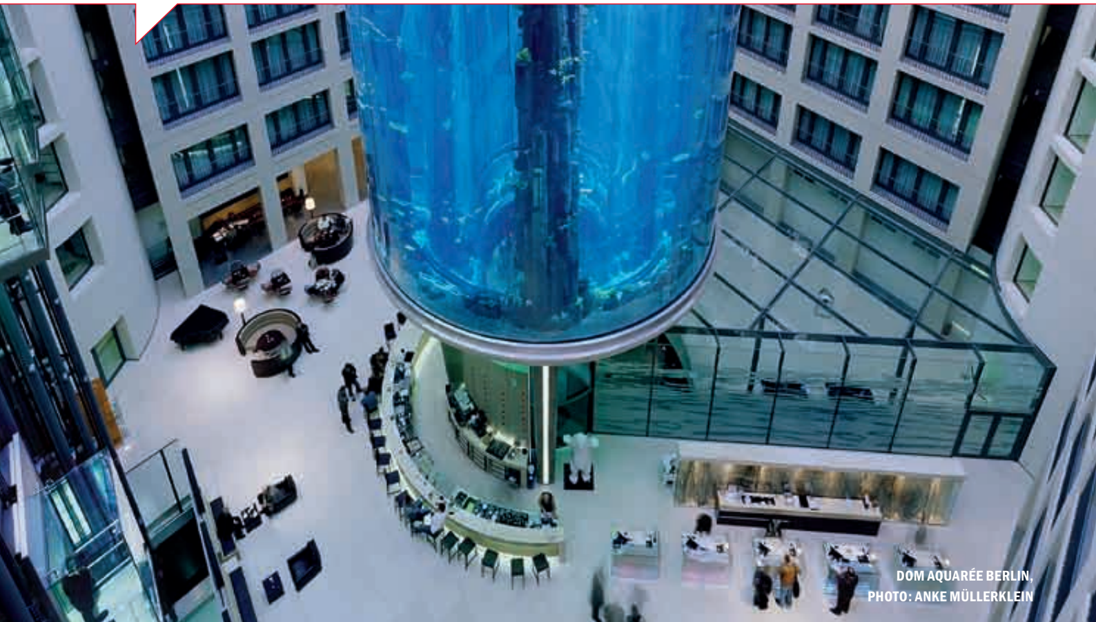
DOM AQUARÉE BERLIN