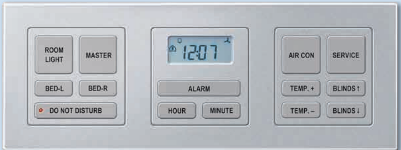
Bed Side Panel, type A, aluminium, M-PLAN design

The Merten Bed Side Panel comes in three versions with different control functions. Every version offers the convenience of dimmable lighting, a clock with alarm function and a “Do Not Disturb” function; all of which can be operated from the comfort of your bed. Types A and B also have integrated automatic heating and air-conditioning (fan coil).