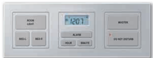
Bed Side Panel, type C, aluminium, M-PLAN design