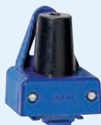
Hanger with bend protection sleeve and strain relief