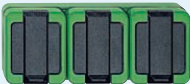
Schuko® triple socket-outlet