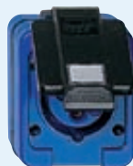
CEE 17 socket-outlet