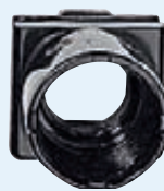
Slide with gland